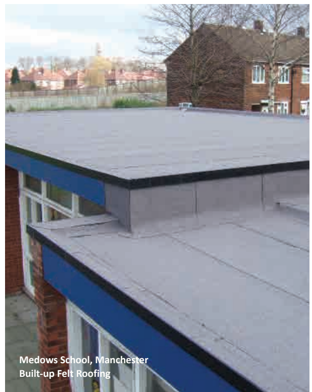
Medows School, Manchester Built-up Felt Roofing