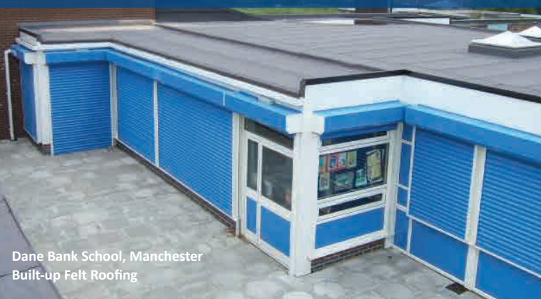
Dane Bank School, Manchester Built-up Felt Roofing

Judges' comments - Cathcart Street Primary School, Wirral - National Roofing Awards Winner