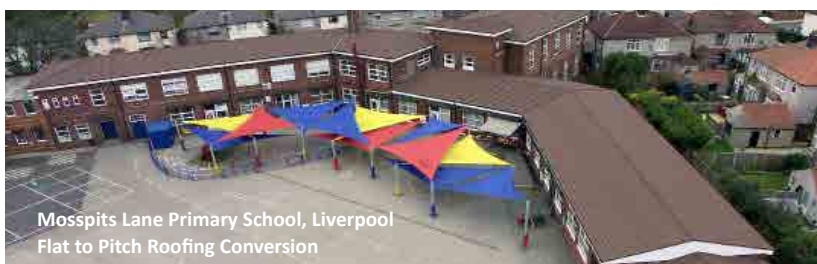
Mossps Lane Primary School, Liverpool Flat to Pitch Roofing Conversion

For additional peace-of-mind, MAC Roofing offers a cost-effective annual maintenance programme, enabling you to keep on top of essential regular roof maintenance. Not only will this help ensure a safe learning environment for pupils and staff, it will also avoid any unnecessary classroom disruption caused by unforeseen problems on the roof.