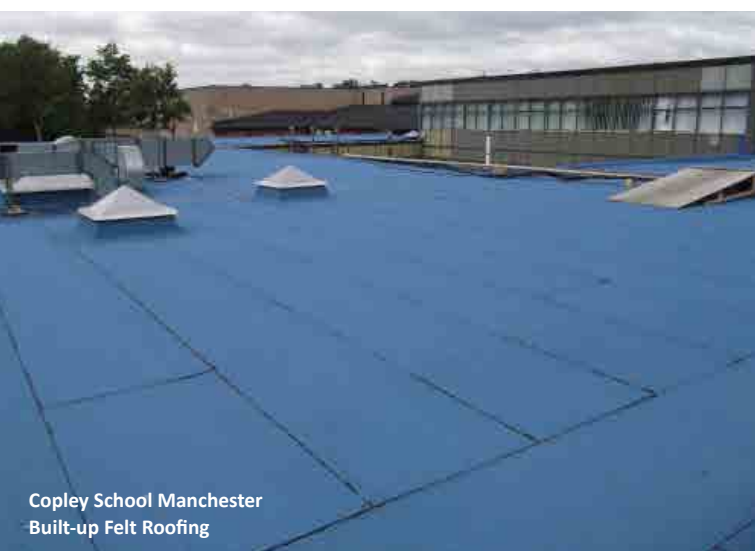
Copley School Manchester Built-up Felt Roofing