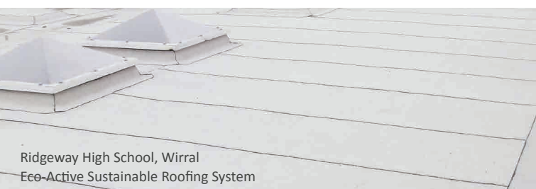
Ridgeway High School, Wirral Eco-Active Sustainable Roofing System