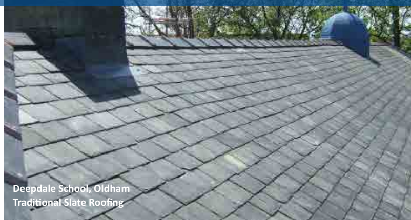
Deepdale School, Oldham Traditional Slate Roofing