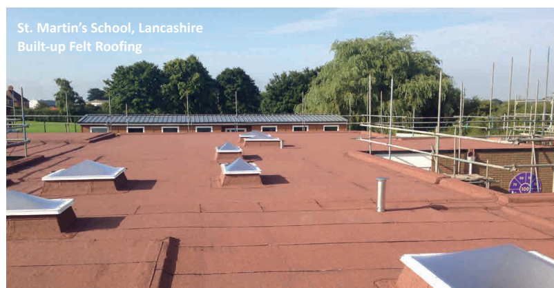
St. Martin's School, Lancashire Built-up Felt Roofing

“MAC delivered the project on time and to budget. An excellent example of how client, contractor and manufacturer can work together to deliver a challenging project safely and efficiently.”