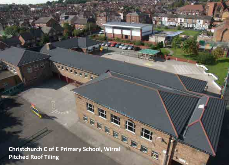
Christchurch C of E Primary School, Wirral Pitched Roof Tiling